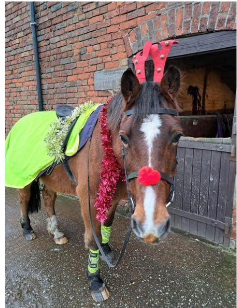
Chloe Walton's festive mount