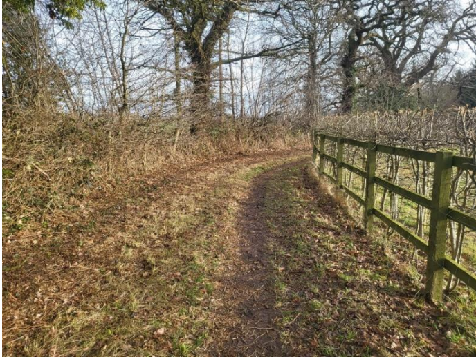
Bridleway Cuddington 16

Bridleway Norley 6 has had the low tree branch removed over the gate at the Cow Lane end which makes it easier and safer for riders to negotiate.