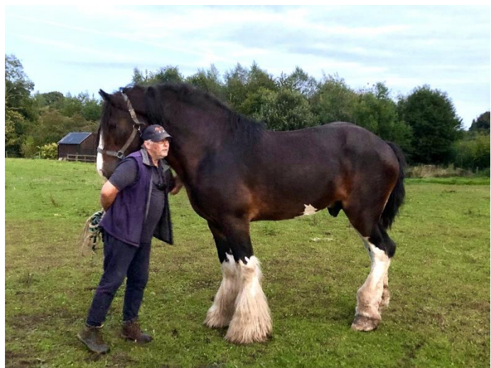
Leonardo the lovely stallion